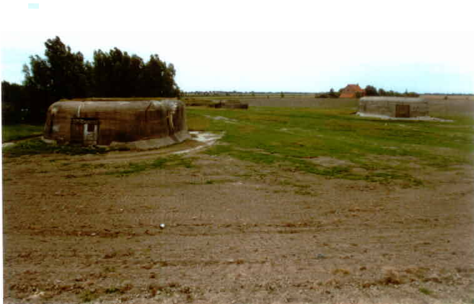
View on both 669's with the "dike" around.

We advised the city to place educational panels with the meaning and function of the bunkers.