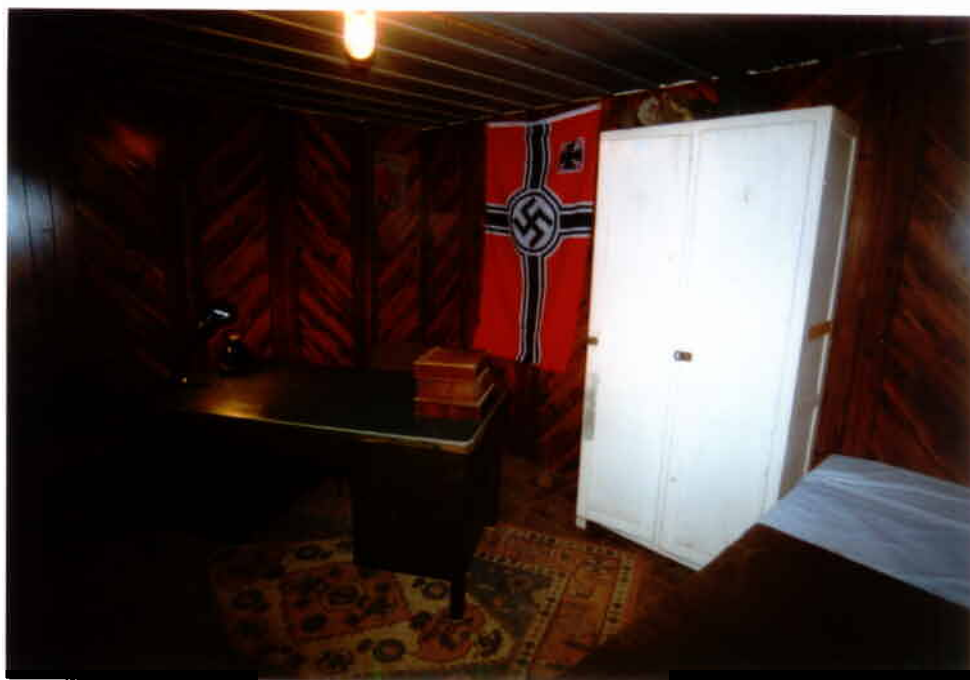
View on the general's room.