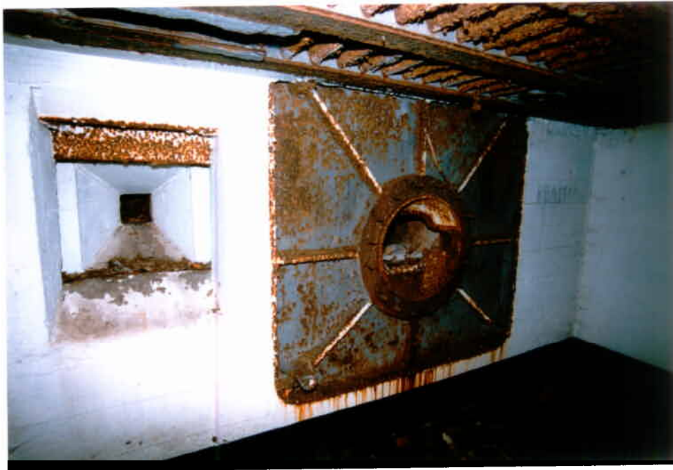
The interior of a casemate for a 7.5 cm gun, type VIII.

In the spring of 2001 WMF started to compile a dossier in order to classify the bunker line but we have since heard that there's no danger because the wood is described as a green belt area. It's forbidden to build anywhere on it.