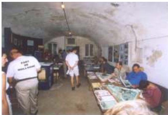
The fair inside.

Many thanks to the participants and to the visitors !!!