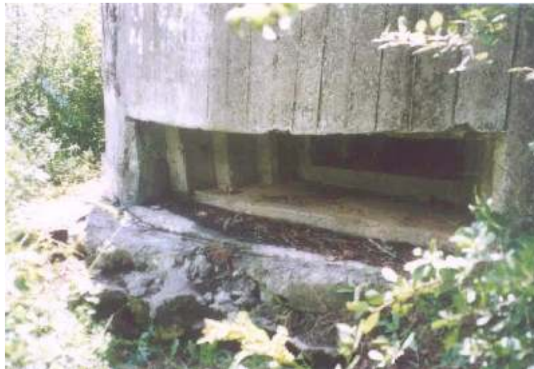
Outside view of the gun fire position

Thanks to Yvonne Mayo for the spell check.