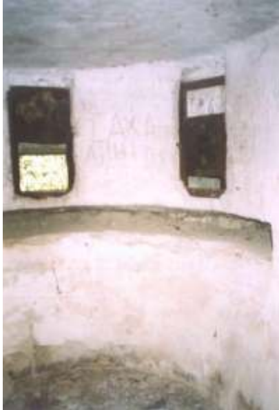
Inside view from 2 fire positions