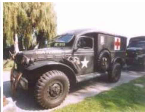
Military vehicles outside.