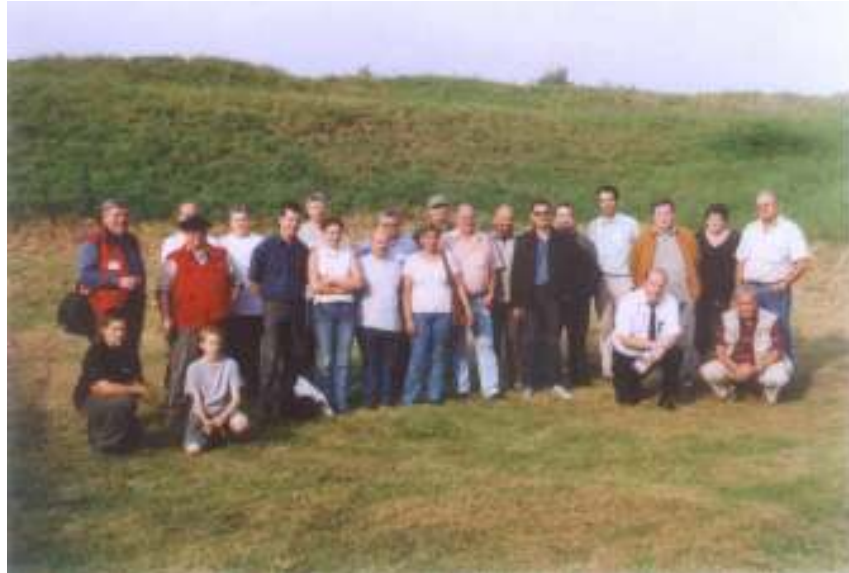
The majority of the participants