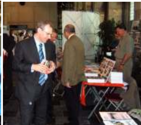
Minister-President Yves Leterme.

A total of 19 associations and publishers were present at our Fortendag comprising 1 Polish and Belgian publisher, 13 Belgian associations, 5 French associations and 1 Dutch author. 9 associations sent us leaflets and posters : 6 French, 2 Dutch and 1 Belgian association.