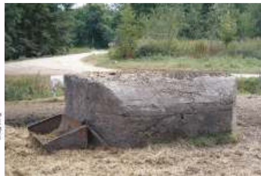
Observation bunker, nr 93.

Some bunkers lie just next to the area that was bought, but good agreements were already made with owners.