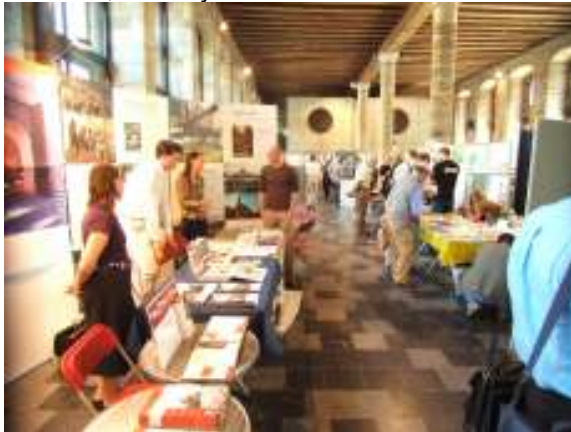
A general view on the fair.