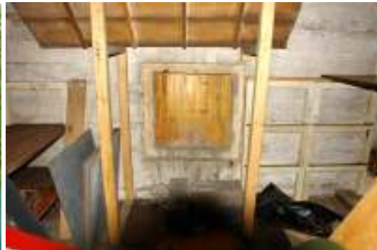
The pass-through inside.