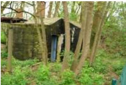
The bunker at the Westhoek domain.