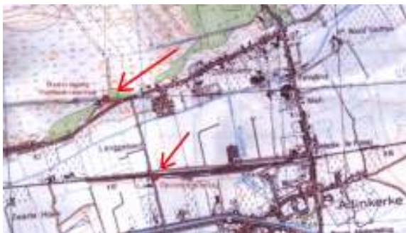
The location of both bunkers.

The curator of Stp Schlieffen, Mr Guido Mahieu, found recently two small bunkers. One is located next to the railroad and looks like an air-raid shelter ( Luftschutz ) The other one is located inside the Westhoek domain at the entrance that is situated on the road between Adinkerke and Bray-Dunes.