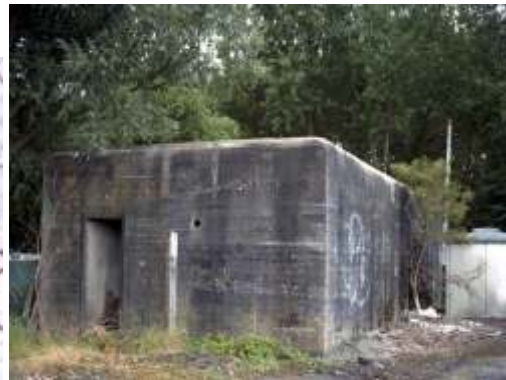
The bunker next to the rail road.