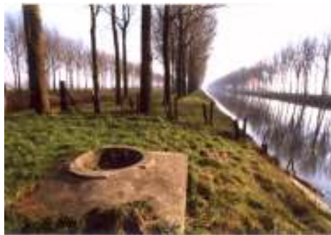
The 621N bunker with its Tobruk. One of the three other Tobruks.