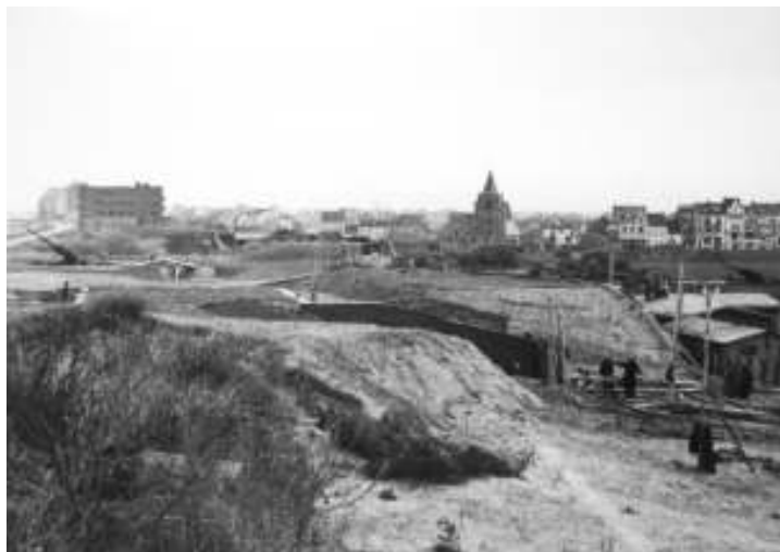
This is an overview of the whole battery looking in the direc-tion of the church of Mariakerke.

Abteilung 252 had 5 batteries, three with six 88 mm FlaK guns (1 st at Mariakerke, the 2 nd at Bredene village and the 3 rd at Ostend). The 4 th and the 5 th Battery had each fifteen 2 cm guns and four 60 cm search lights. Next to the 88 mm guns, the 1 st Battery had three 2 cm FlaK guns for its own defense and two MG34 machine guns. 134