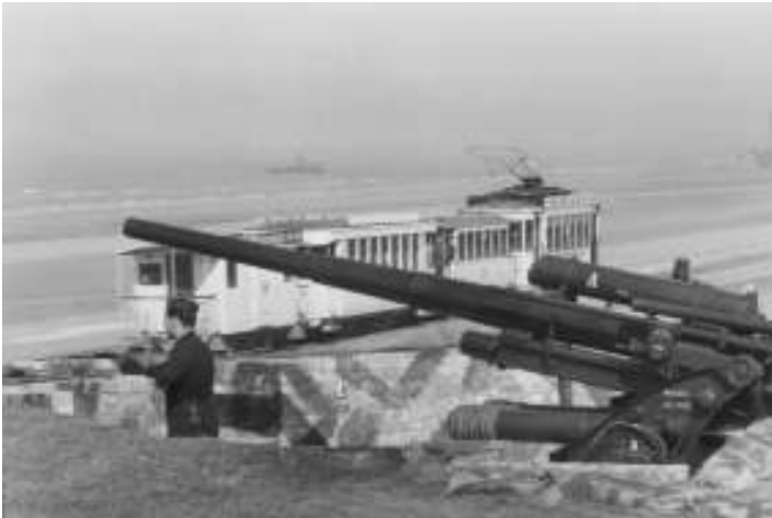
This is probably the best know photo of Stp Boelcke with one of its 88 mm guns

Last summer, one of our members, Mr Pierre Nowak, discovered the remains of an open emplacement of one the heavy FlaK batteries around Ostend. The open emplacement lies very close to the church of Mariakerke. You see it when you start walking towards Raversijde on the small road on the land side of the dunes. You see the back of an emplacement because the front part lies under the sand. This discovery leads us assume that the constructions in the dunes are still there, but covered with sand.