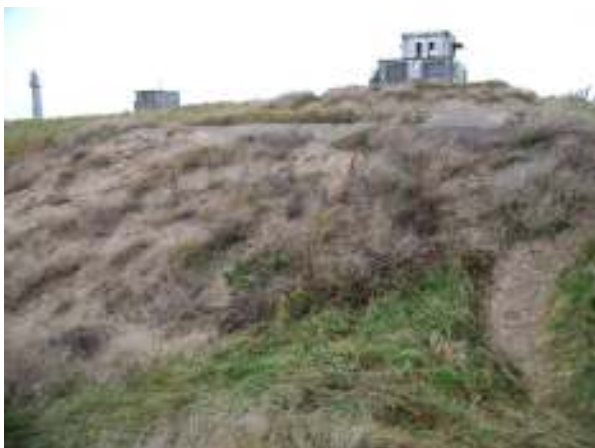
The crew bunker for 15 men, Regelbau 656, in January 2007.

During the autumn, one of our members warned us that all the bunkers of Stp Dietl at the "Halve Maan" (half moon) near the port estuary have been covered with sand. Only the open emplacements survived. A sad destiny for a monument protected since October 1997 ! What's the present situation ? A company is busy with the destruction of the eastern pier and between the slipway and the Halve Maan they are building windmills. The owner, Maritieme toegang (Maritime Access), says they have the bunkers closed for security reasons. People could fall off it and strange things happened inside. They declared that a renovation project will follow after the finishing of the windmills. Let's hope !