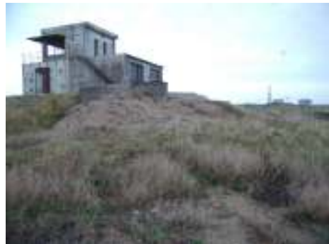
Command bunker 610 during January 2008.

On the sea-side they will create again a salting area and on the land-side a fresh water dune area. They will excavate the sand from the bunkers and remove the additional constructions that spoil the original design of the bunkers. The command bunker (610) will be the central point of the guided tour and the crew bunker (656) can be visited with a guide. Moreover the open emplacement in front of the 610 and the embrasure of the machinegun casemate (515) will be excavated of sand. But the accent will be on nature. All these works will be executed with the aid of the Flemish government, Natuurpunt and C-Power.