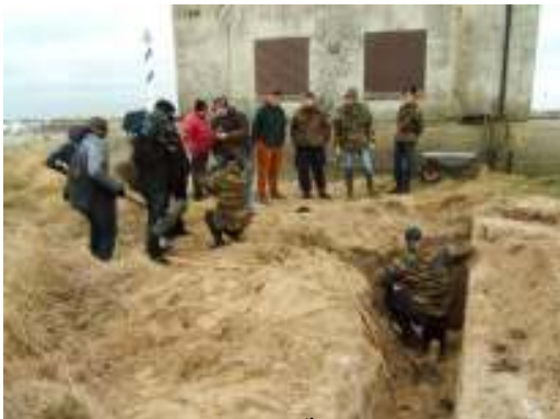
The press on January 4 th at the excavations

Ok, what now? Subsidies and offers for the renovations have been asked. The last unknown bunker was excavated and opened on January 4 th in presence of the press. Here we are talking of the machine gun bunker (515) (more about this in the next edition). The ugly pole on top of the M157 has been removed and they are making a new, decent fence around the Hundius battery. An architect office will be assigned during 2009. What we could see this year is that the wet moat in front of the Halve Maan will be restored.