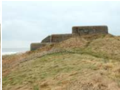
The M157 without ugly pole!

Do you want to know more? Surf to the project coordinator's, Buitengoed, site : www.oostendeoosteroever.be