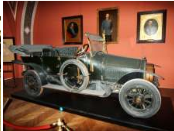
The car of Franz-Ferdinand