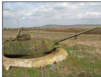
A Russian T34/85 tank turret.

The tanks and their adjacent bunkers were forgotten by the army, but not by souvenir hunters. Bit by bit they were scrapped and it became a lucrative business in Bulgaria.