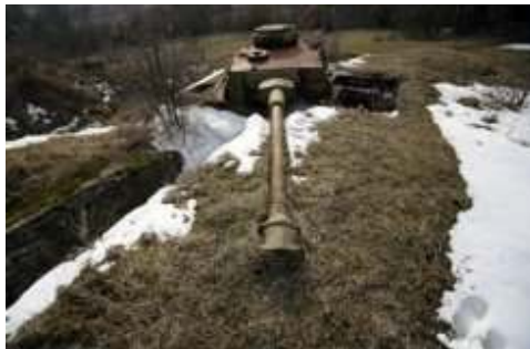
A German Panzer IV tank half-buried at the Bulgarian-Turkish border

After the dissolution of the Warsaw Pact in 1991, Bulgaria joined the NATO in 2004.