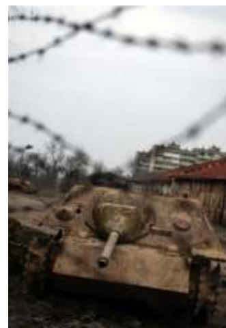
A German Jagdpanzer IV L/48 tank

In March 2008 12 tanks have been excavated so far. A defence ministry agency is storing them until the army